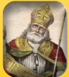
St Nicholas Winchcombe