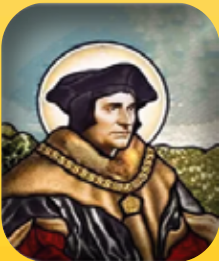
St Thomas More Cheltenham