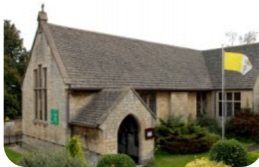
St James Chapel